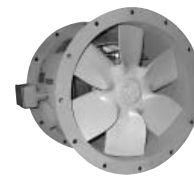
Marine - Mine Duty Blowers

Hartzell Fan, Inc., Piqua, Ohio 45356 • Plants in Piqua, Ohio and Portland, Indiana.