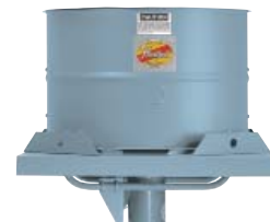
Roof Ventilators - Steel & Fiberglass