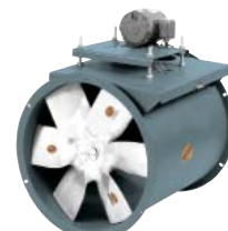
Duct Axial Fans