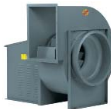
Steel Centrifugal Blowers