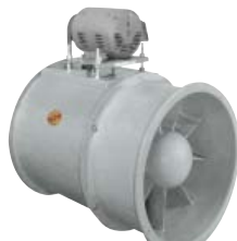
Fiberglass Axial Flow Fans