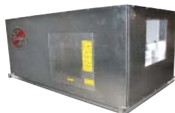
Heating Equipment - Gas & Steam