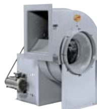
Fiberglass Centrifugal Blowers