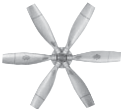
Cooling Tower & Heat Exchanger Fans